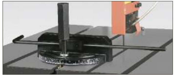
Miter Gauge for Hydraulic Table Shown