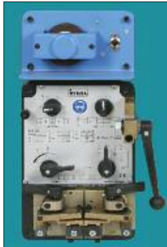
Clausing Installed Welder, Shear, and Grinder. Welder capacity: 1" carbon Blades.